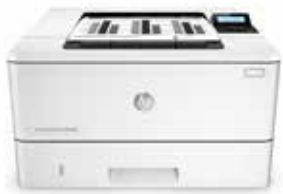
HP LaserJet Pro M402dn