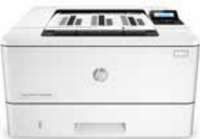
HP LaserJet Pro M402dw