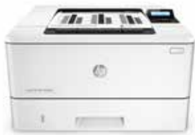
HP LaserJet Pro M402n

Printing performance and robust security built for how you work. This capable printer finishes jobs faster and delivers comprehensive security to guard against threats. 1 Original HP Toner cartridges with JetIntelligence give you more pages. 2