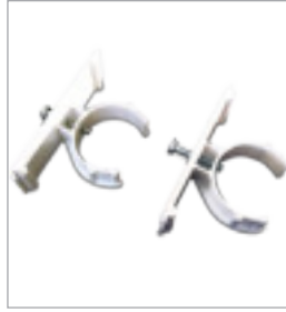
lilitab Backdrop Graphic Clips