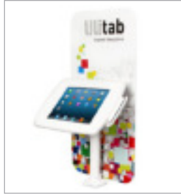
lilitab Counter Backdrop Graphic