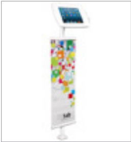
lilitab Banner Graphic