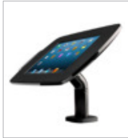
lilitab Surface Basic