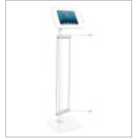
lilitab Banner Mount