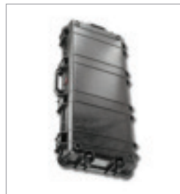
lilitab Floor ATA Flight Case