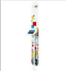
lilitab Backdrop Graphic