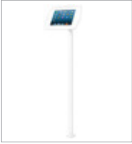
lilitab Floor Pro Line