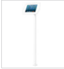
lilitab Floor Basic