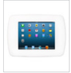
lilitab Head Unit