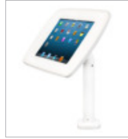
lilitab Counter Basic