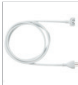
Power Extension Cord