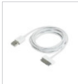
6' iPad Charge and Sync Cable