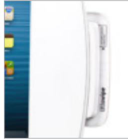
liliSwipe Secure Card Reader