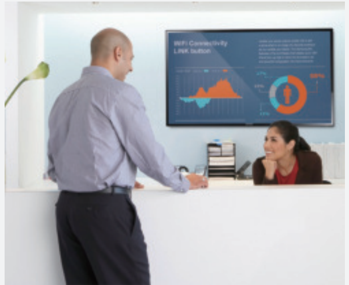
Figure 2. Samsung EDD Series deliver high-definition images with easier connectivity